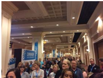
The opening of NexGen One UGM