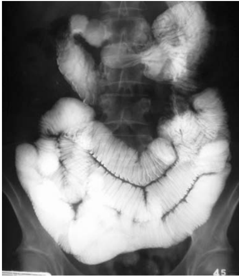
Figure 1. Radiograph of the small bowel showing areas of dilation.

be a cause of obesity. 15 Methane-producing bacteria, especially Methanobrevibacter smithii , lower the partial pressure of hydrogen by utilizing hydrogen and carbon dioxide after degradation of polysaccharides, allowing for further degeneration of polysaccharides and ability to provide more calories. This newly described role of bacterial flora in the etiology of obesity in man is a controversial but exciting development.